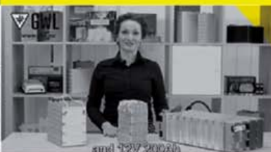
NEW: smaller and lighter GBS 12V Lithium...

GWL YOUTUBE VLOGS feature battery tests, tips and tricks, practical instructions or DIY MANUALS to help our clients make the RIGHT CHOICES .