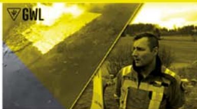
Firefighter opinion + outtakes of Lithium battery...