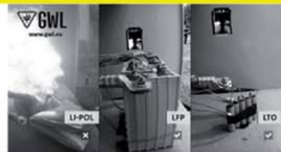
Dangerous vs. Safe batteries, Explosion and fire...