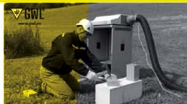
How toxic are the Lithium batteries and...